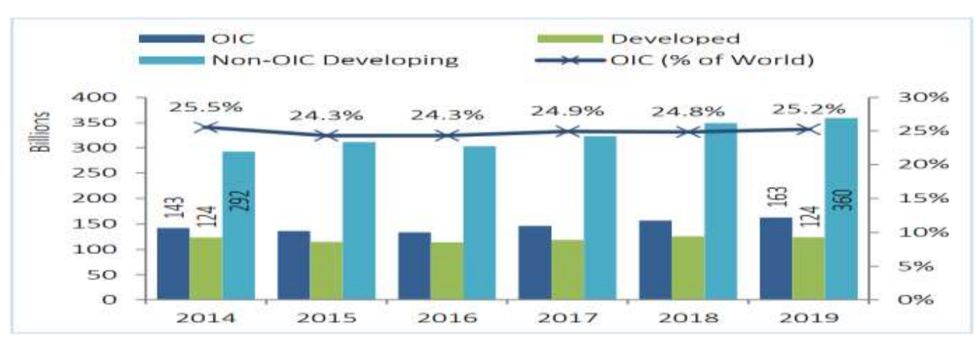
Figure 1 Remittance Growth in OIC Countries

Saiz, Dridi, Gursoy, &Bari, 2019). This can be proven in figure 1 below: